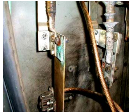
Fig. 2- Fused Switch Cable Fault

Another reason to be concerned about Arc Flash Hazards is liability and government regulations. OSHA regulations apply to every worker that may approach or be exposed to energized electrical equipment. If an Employer fails to conform to and follow OSHA and NEC requirements, it can lead to employee injuries, inconvenient penalties, expensive fines and law suits. OSHA is has adopted and is enforcing NFPA 70E. Please see the attached OSHA news release at the end of this section.