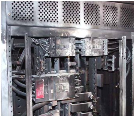
Fig. 1- Fault in Switchboard

The number one reason to be concerned about arc flash is for the safety of personnel. (Please see figures 1 & 2.) Arc Flash Hazard Studies are performed to determine the risk to personnel, warn them of the hazards, and to instruct them as to what kind of personal protective equipment (PPE) they must wear.