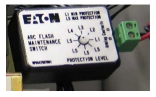
ARM Trip Unit

Breaker with Retrofitted Trip Unit and ARM Unit