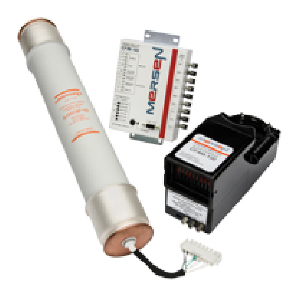
Medium Voltage Controllable Fuse (MVCF)

Remember, Distance and short time delays are your friends when it comes to the electrical arc flash hazards. Increasing the working distance or decreasing the tripping times lowers the arc flash energy exposure. There are many ways to reduce the tripping times of protective devices. The solutions are very equipment specific and just one solution can not be applied everywhere in a distribution system. Sound engineering analysis and design is needed to determine the best and most cost effective method to reduce the arc flash energy. Before you operate that electrical equipment, stop and think about ways to operate it remotely and/or decrease the upstream operating trip times. This could save your life!