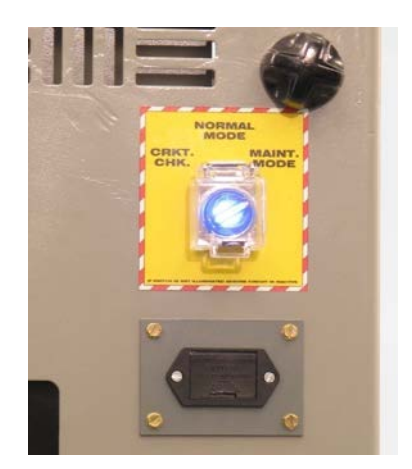
Door Mount ARM Switch

be conducted and the energy level downstream calculated. Then a label should be created and installed on the downstream equipment showing the arc flash level under normal conditions and the ARM conditions.