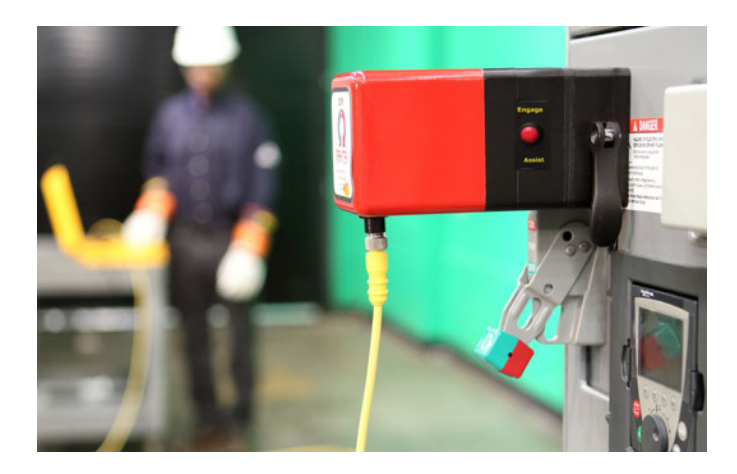
Motor Control Center Bucket Racking Device

Although well maintained electrical equipment is very reliable, it can sometimes fail. Sometimes these breakers, disconnect switches, or motor starters fail and an arc flash event is started. If this equipment can be operated with distance between the equipment and the operator, then it will be much safer. However, some equipment is manually operated. There are several types of portable (attachable) remote operating devices. Again, the operator will have a 15 to 20 foot control cable and remote control operator unit. Below are a few different types.