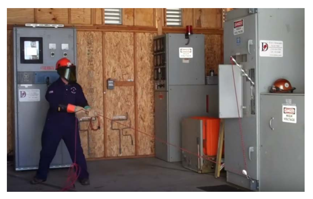
Manual Operation of a Medium Voltage Switch with Rope and Pulleys

Another way to remotely operate manually operated switches and circuit breakers; this can be performed using a system of <u>pulleys and rope</u>. Pulleys are strategically located above and below the switch. Rope is then attached to the handle which enables the operator to get distance between the operator and equipment. Below is a picture showing how to manually operate a medium voltage switch.