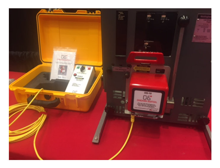
Power Circuit Breaker Remote Operator Device

Another way to remotely operate manually operated switches and circuit breakers; this can be performed using a system of <u>pulleys and rope</u>. Pulleys are strategically located above and below the switch. Rope is then attached to the handle which enables the operator to get distance between the operator and equipment. Below is a picture showing how to manually operate a medium voltage switch.