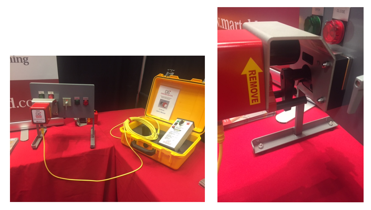
Panel Control Switch Remote Operator

Although well maintained electrical equipment is very reliable, it can sometimes fail. Sometimes these breakers, disconnect switches, or motor starters fail and an arc flash event is started. If this equipment can be operated with distance between the equipment and the operator, then it will be much safer. However, some equipment is manually operated. There are several types of portable (attachable) remote operating devices. Again, the operator will have a 15 to 20 foot control cable and remote control operator unit. Below are a few different types.