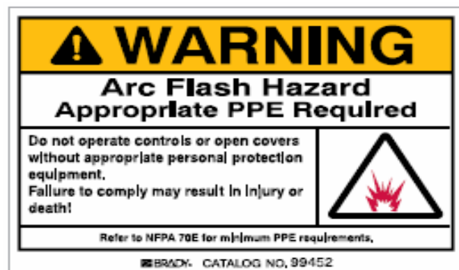
Figure 2 – Generic (Unacceptable) AF Label Listing Details